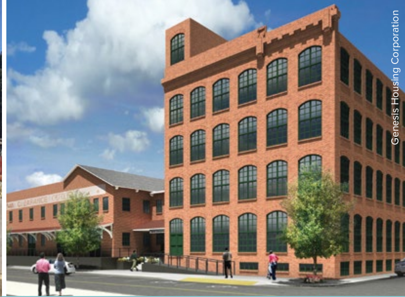
Left: Rebuilding in Mt. Carmel. Right: Beech Street Factory in Pottstown.