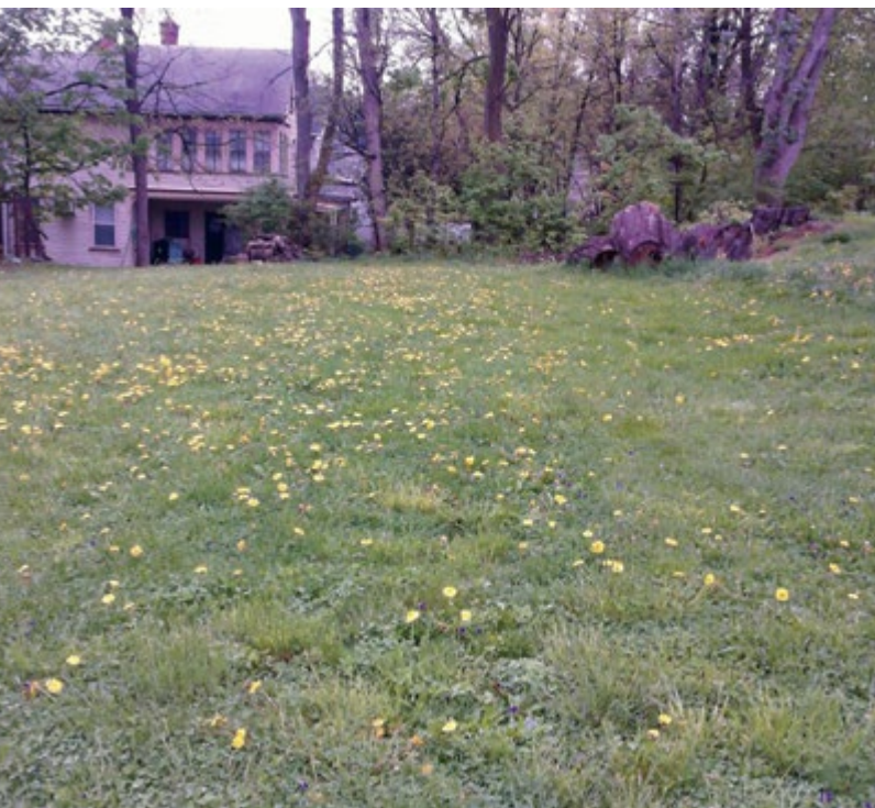
Side Lot Property, Scranton Lackawanna County Land Bank

On May 4, 2018, the Land Bank sold its 50th property in Scranton, a vacant building on the 1100 block of Capouse Avenue. A couple that had recently opened a vintage shop across the street were concerned that the deteriorated property would have an adverse effect on their business, and they decided that they wanted to rehabilitate the building, with retail space on the ground floor and a residential unit upstairs. “We’re already a part of this neighborhood now and we just hope to keep on making it better and better,” one of the buyers told PA homepage.