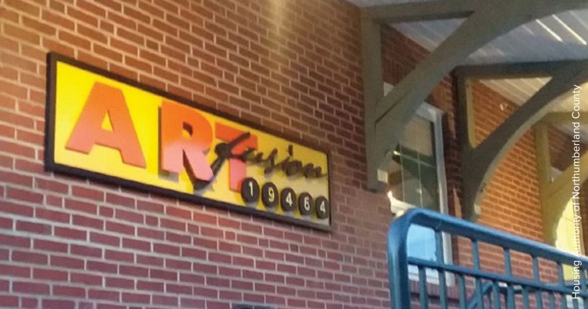
Housing Authority of Northumberland County