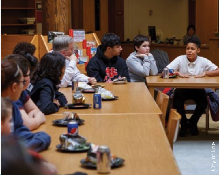
City of Erie