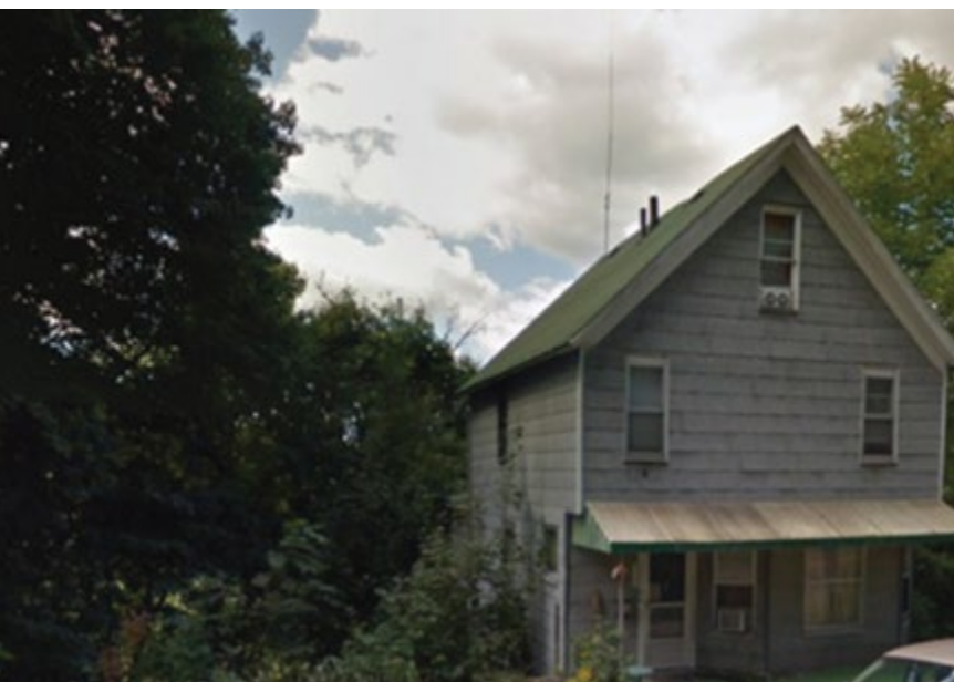
Land Bank Acquisition: East Bissel Avenue, Oil City

The Land Bank’s approach is straightforward. When the list of addresses to be auctioned at the tax sale is published,