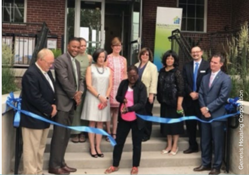
Genesis Housing Corporation