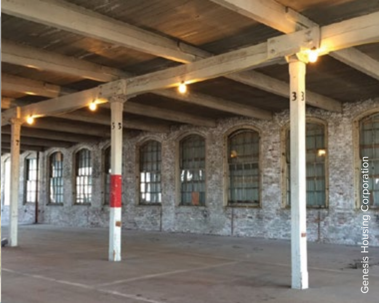
Genesis Housing Corporation