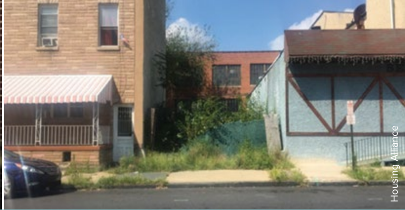
Left: Property sold at Judicial Tax Sale, North 5th Street, Reading. Right: Repository Sale Property, Franklin Street, Reading.

county or city itself. Making contact with these easier-to-reach owners and influencing them to achieve compliance with codes—through the filing of a civil action if an owner is unresponsive to code enforcement citations—increases the likelihood of successful outcomes.