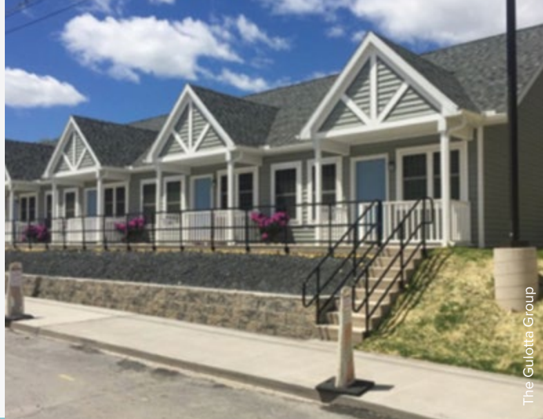
Demolition of fire-damaged houses on West Girard Street. Right: Completed Phoenix Court development.