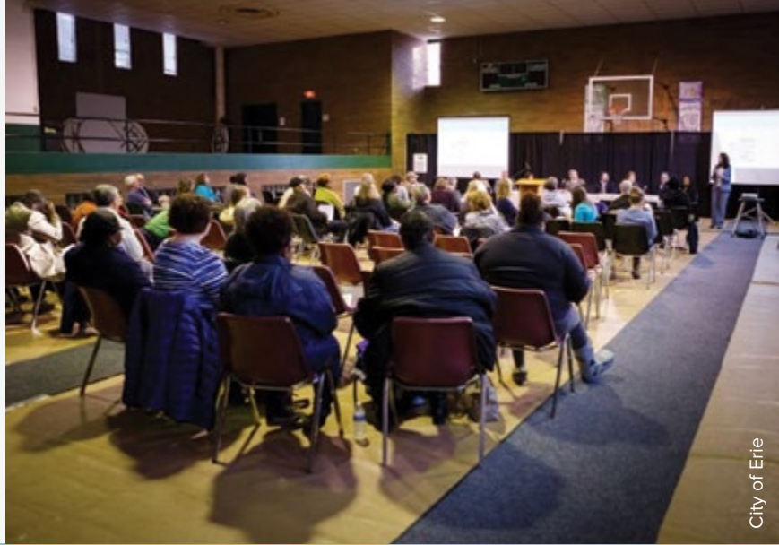
City of Erie