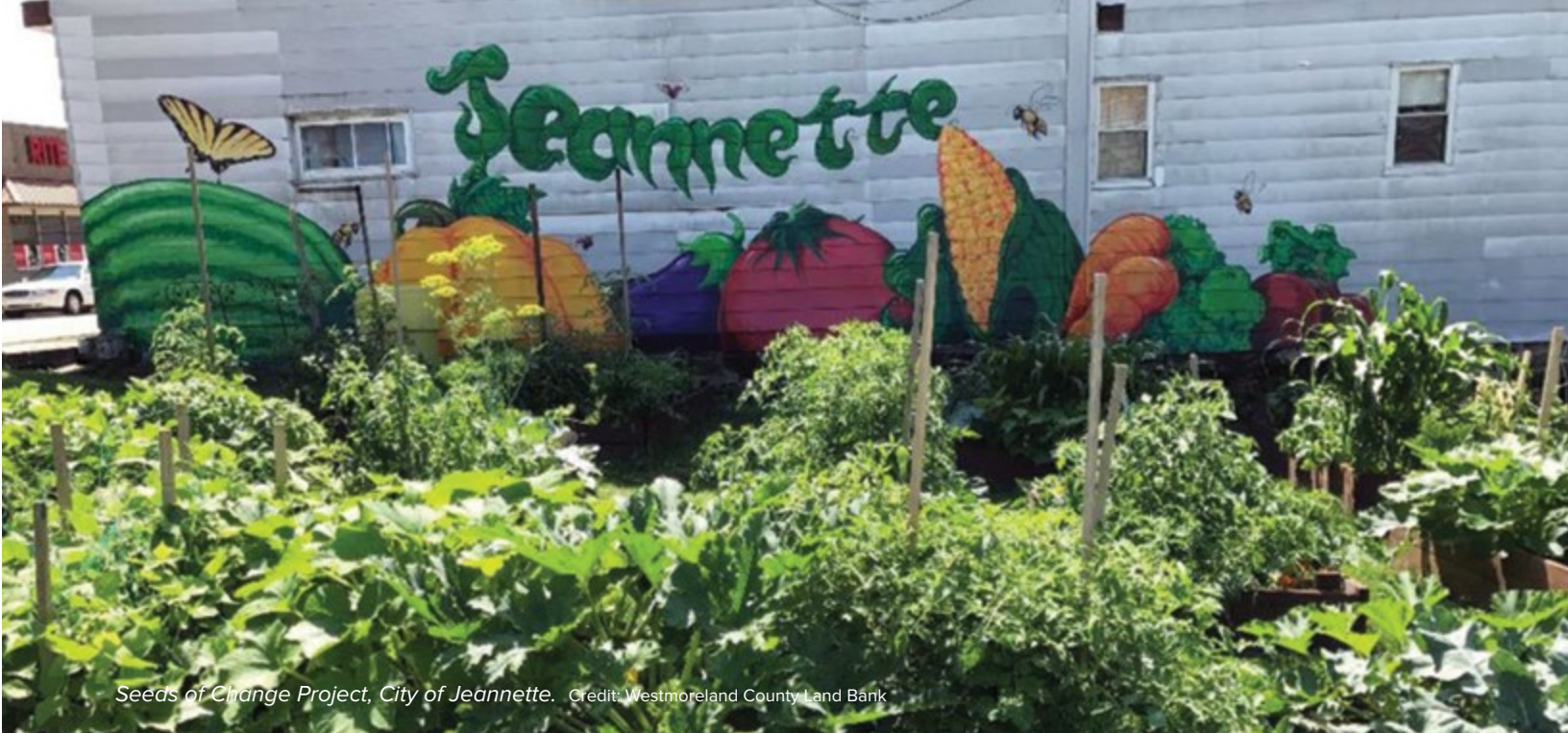
Seeds of Change Project, City of Jeannette.