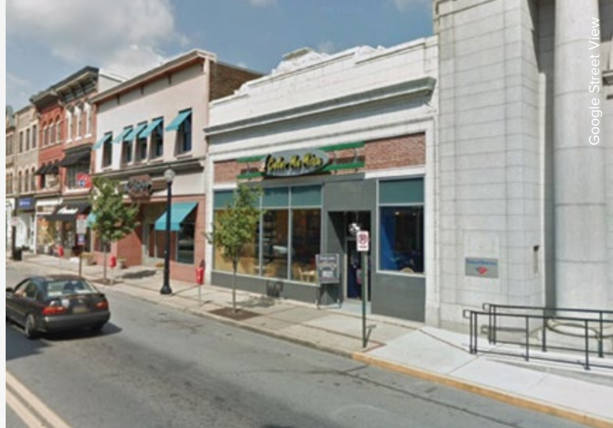
Left: Goodman Building Prior to Conservatorship Action. Right: East 3rd Street Streetscape Opposite Goodman Building.