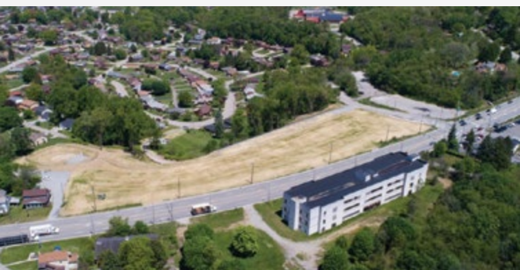
Monsour Medical Center Site on Route 30 Westmoreland County Land Bank

Following marketing and an evaluation of competitive proposals for the development of the site, the Land Bank selected Colony Holdings, Inc. to purchase the property for $2.1 million. The firm will build a retail and office center, Jayhawk Commons, on the site. As provided in the state enabling legislation, the Land Bank will receive half the real estate tax proceeds generated by the project during the first five years of operation following the completion of construction.