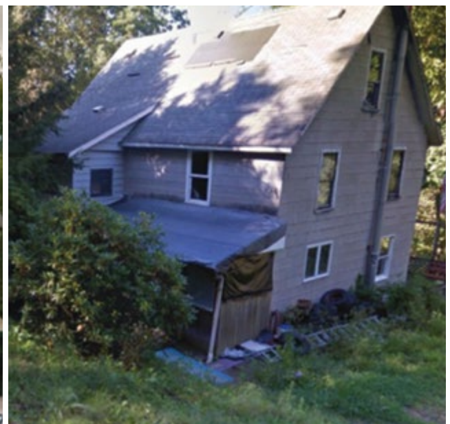
Land Bank Acquisition: Hiland Avenue, Rouseville Google Street View