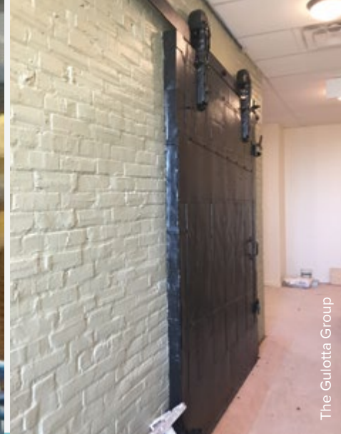
The Gulotta Group